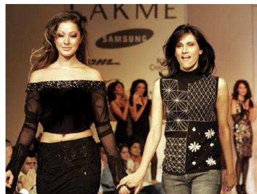
Fashion shows are very popular with the media.

As citizens of a democracy, the media has a very important role to play in our lives because it is through the media that we hear about issues related