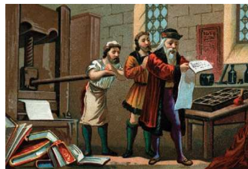
An artist's impression of Gutenberg printing the first sheet of the Bible.

Look at the collage on the left and list six various kinds of media that you see.